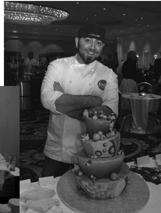
Above: Chef Duff Goldman, Charm City Cakes