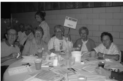
St. Anthony Site Volunteers